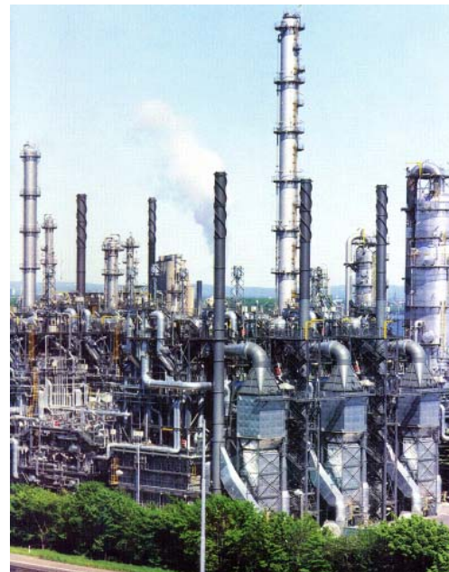
Basell's ethylene complex in Wesseling, Germany

Basell owns and operates two ethylene plants in Wesseling, Germany. Basell wanted to maximize profits from its MG4 ethylene plant by optimizing throughput and minimizing losses due to poor quality control. However the plant was both