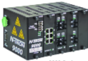
9000 Series with GbE Support

✓ NEMA TS1/TS2 Compliance for Traffic Control Equipment